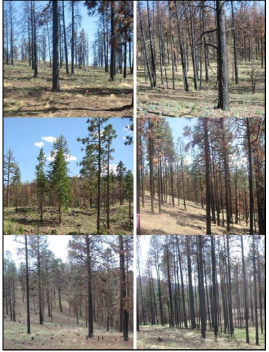
Figure 1. Paired treated (left) and untreated (right) units.

In this study, ERI researchers used a post-wildfire field measurement approach to study and describe the effectiveness of WUI hazardous fuels treatments in reducing fire behavior and conserving forest resiliency during the Wallow Fire, a 538,000-acre uncharacteristically, high-severity wildfire that burned in Arizona in 2011. Our primary goals were to: 1) measure changes in burn severity as the wildfire transitioned from highseverity untreated to treated areas, 2) compare ponderosa pine tree mortality and basal area (BA) loss across paired treated and untreated areas,