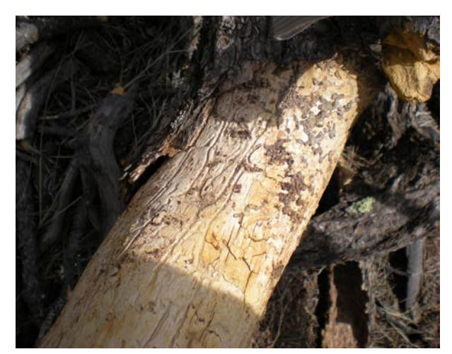
Figure 2: Bark beetle galleries.