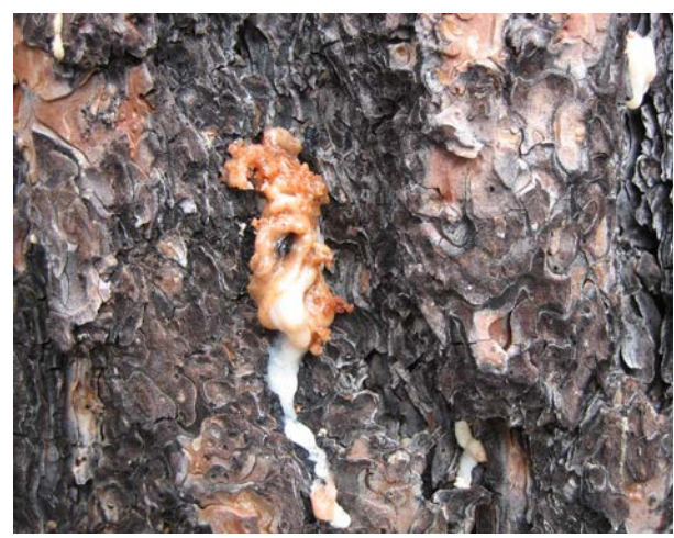
Figure 1: Pitch tube and frass in bark crevices on a ponderosa pine tree.

temperature will likely have a direct impact on the beetle itself whereas water stress (exacerbated by increased temperatures and periods of drought) will indirectly impact the beetle via impacts on the host trees (Bentz et al. 2010).