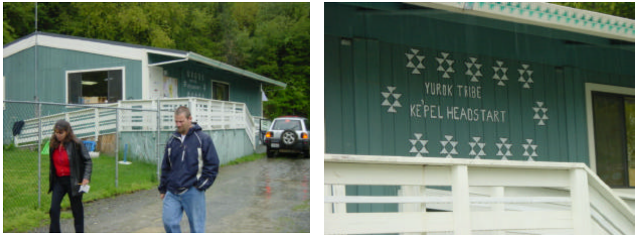
Figure 1 – The Ke’pel Head Start Facility on the Yurok Reservation in northern California.

Information Administration 2000). Had the choice been made to use T8 lighting fixtures instead of T12 at the time the building was designed and constructed, the savings could have been much larger since the size and cost of the electrical generation equipment could possibly have been reduced (the cost of electricity at an off-grid facility