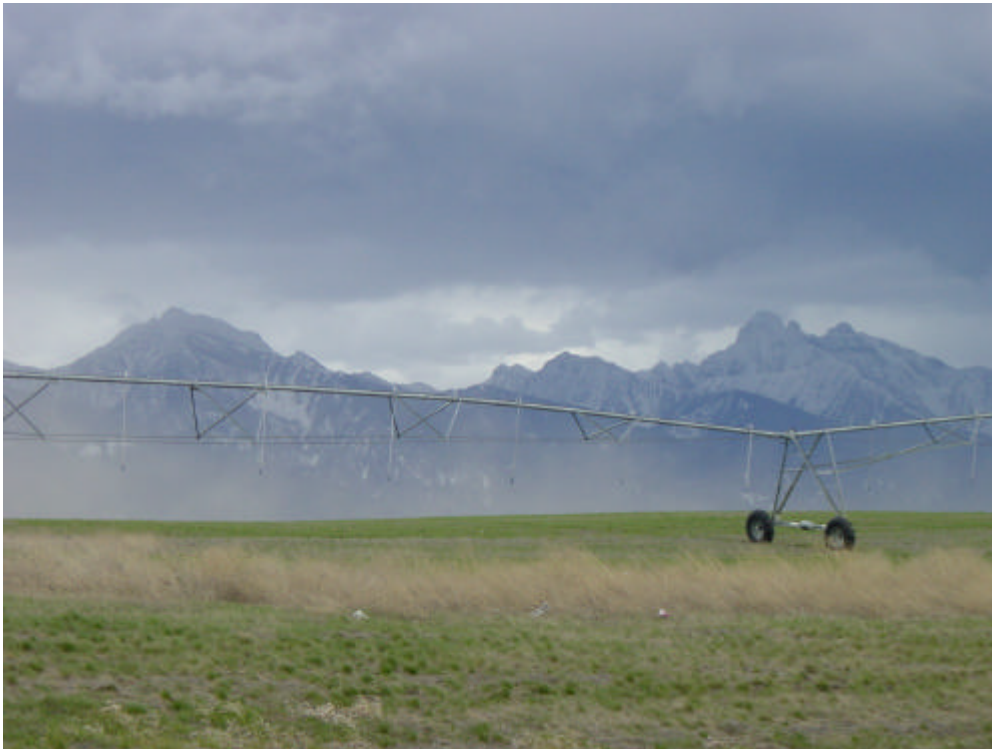
Figure 3 – A typical irrigation system on farmland within the Flathead Reservation in Montana. The haze above the field has been caused by dust blown up from a dirt road, one of the primary sources of haze within the reservation.

The external boundaries of Flathead Reservation encompass 1.2 million acres, including thousands of acres of farmland. Some of this land is tribal land and some of it is privately held. MVP provides electrical service to all of the farms. During the summer months many of the farms use irrigation. A picture of a typical irrigation system is shown in Fig. 3, and a picture of the large electric water pumps that might supply such a system are shown in Fig. 4. Large water pumps that run on electricity are required to draw water from an irrigation canal and feed these irrigation systems. During fiscal year 2001, irrigation customers accounted for approximately 8 percent of the electricity sold by MVP, and MVP is interested in exploring the potential for energy savings through irrigation system improvements.