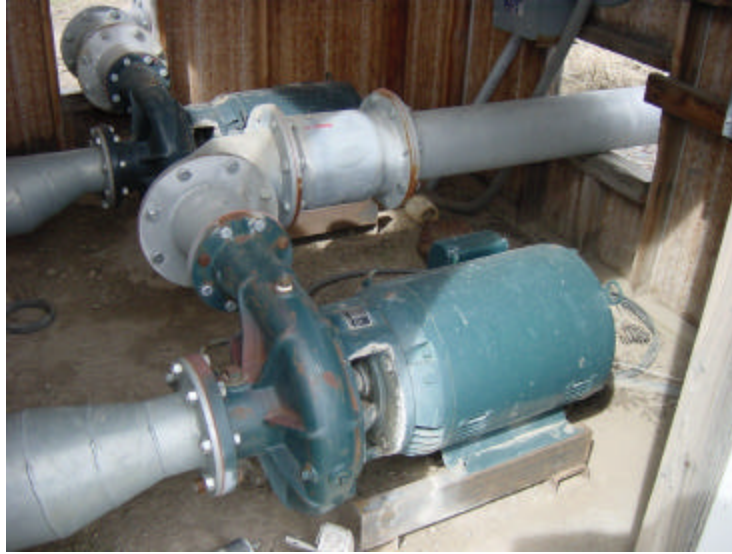
Figure 4 – Large electric water pumps used to draw water from a nearby irrigation ditch and supply irrigation equipment.