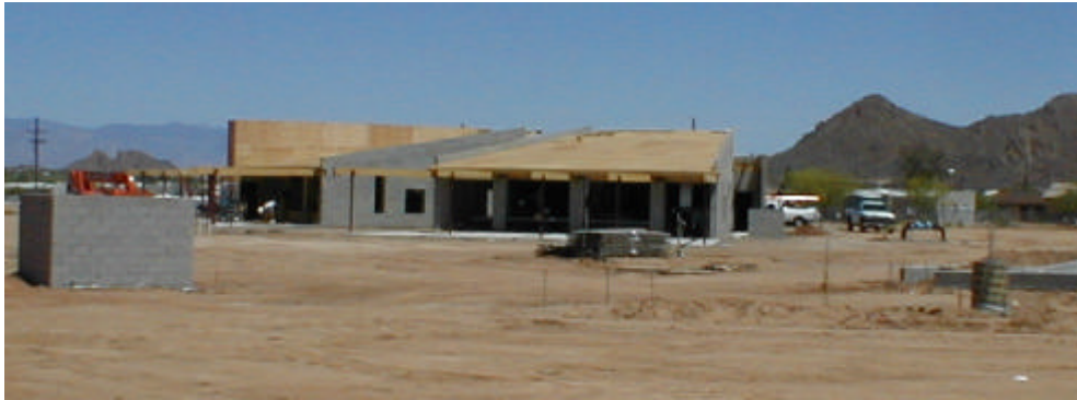
Figure 5 – A new Head Start facility under construction on the Pascua Yaqui reservation in southern Arizona.