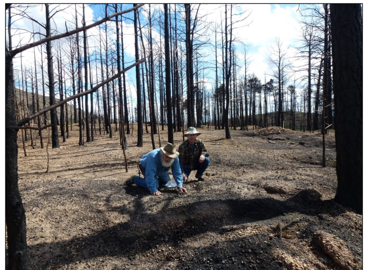
Figure 1. Wind driven crown fires consume surface detritus, needles and fine branches but leave heavier woody fuels intact. Above, the Las Conchas Fire incinerated more than 30,000 acres of timber in a single burning period near Cochiti Mesa, Santa Fe National Forest, in summer 2011.

As ecosystems are replaced following high severity disturbances, the new systems that reestablish in a warmer climate may not resemble those that developed during the cooler and wetter 19th and 20th centuries. Existing biome locations are predicted to synchronously move north or up in elevation to maintain viability in their climate envelope (Figure 2, p. 2).