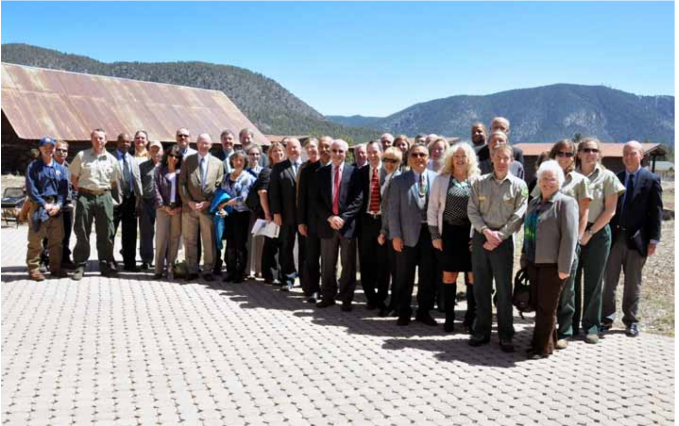
Partners gathered at the Museum of Northern Arizona's Easton Collection Center for the FWPP signing ceremony, with the Dry Lake Hills in the background. One of the unique factors for FWPP success was the ability of all levels of government and citizens to work together.