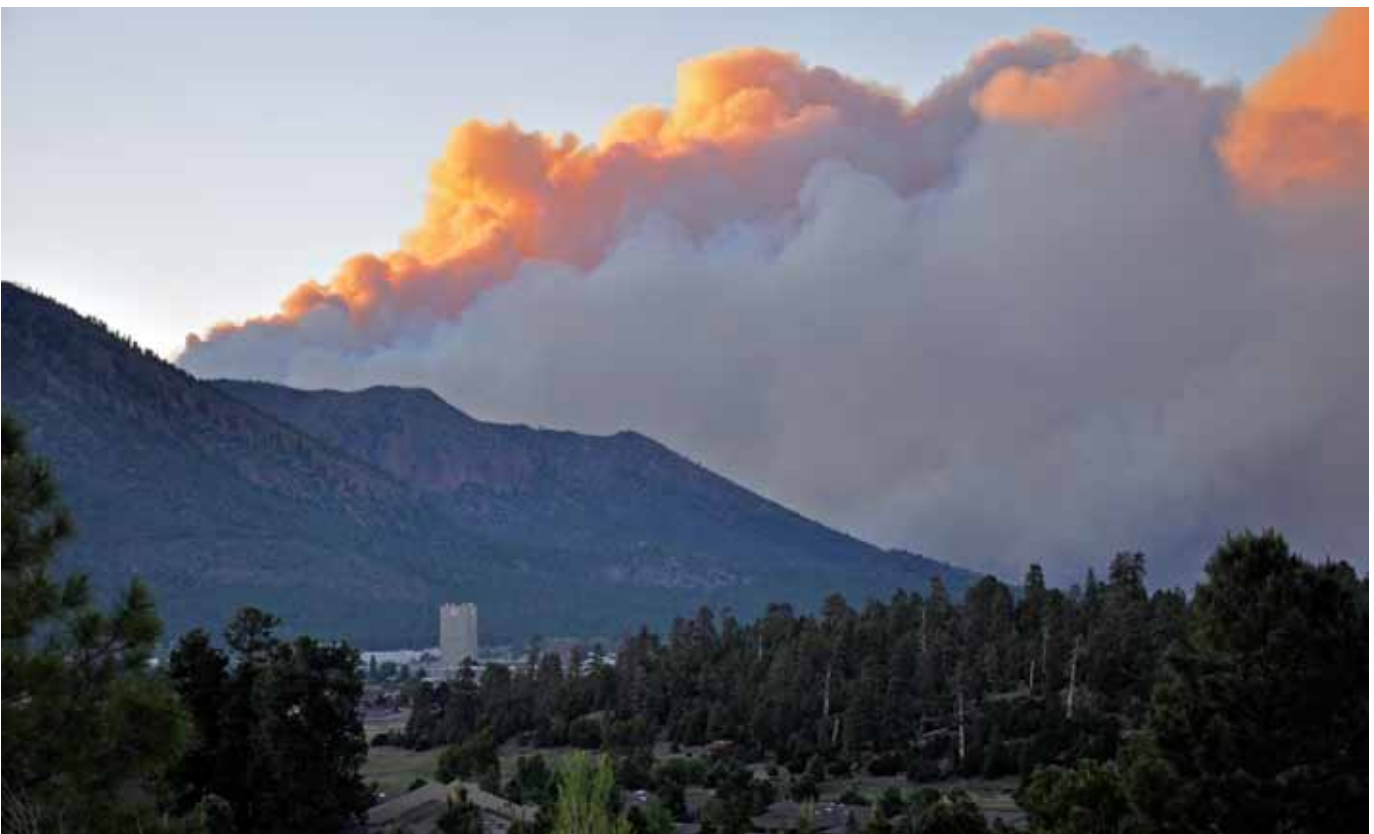
The 2010 Schultz Fire burned 15,000 acres of untreated forest north of Flagstaff, Arizona. The cost to fight the fire and mitigate the subsequent flooding was estimated between $133 and $147 million (Combrink et al. 2013).

The purpose of this white paper is to convey to other communities, municipalities, and/or government agencies the administrative functions and mechanisms used by the two primary partners, the City of Flagstaff (City) and the U.S. Forest Service (also referred to as USFS, the forest, the Coconino National Forest, and the National Forest), to develop and implement FWPP. The paper is designed as a case study for other entities considering a similar initiative. This case study spans the first two years of the project (see Figure 1, page 4), from the bond election in November