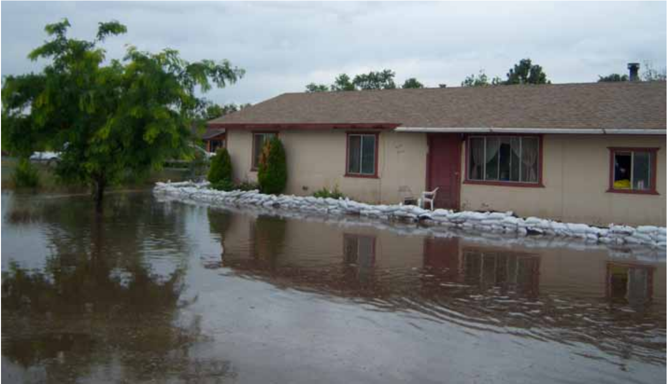
Residents living below the Schultz Fire burn area experienced extreme flooding after monsoon rain events in months following the fire. Results of an analysis by the Ecological Restoration Institute indicated that the fire directly and indirectly contributed to a loss of approximately $60 million in the personal wealth of local property owners (Combrink et al. 2013).

2012 to December 2014. Personal interviews were conducted with key personnel from the City and the USFS. This report summarizes findings from the interviews and information derived from review of City and USFS internal project documents.