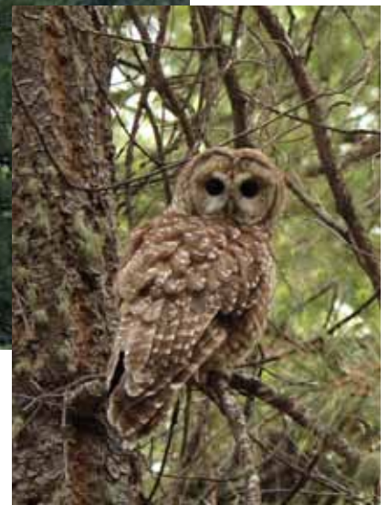
Challenges partners faced included difficulty in treating steep, rocky slopes like the Dry Lake Hills (left/above) and the presence of threatened species habitat like the Mexican spotted owl (right).

post-fire flooding events damaged downstream rural neighborhoods, aquifers, critical city and county-owned infrastructure, and tragically resulted in the loss of a life.