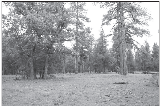
Figure 1 —Ninety-three year photo series of a Gambel oak clump (left center) that increased in density by approximately 75 percent from 1913 to 2006. The photos were taken near Coulter Cabin in the Coconino National Forest, 12 miles (19 km) south of Flagstaff, Arizona. The 1913 photo was taken following a group selection harvest of ponderosa pine. The 1913 and 1928 photos were taken by Hermann Krauch (U.S. Forest Service photo 16491A), the 1959 photo was taken by M.M. Larson (U.S. Forest Service photo LA-86), and the 2006 photo was taken by A.J. Sánchez Meador. Photos provided by A.J. Sánchez Meador (U.S. Forest Service).