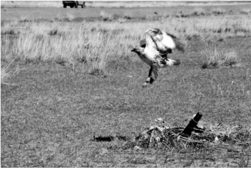
Figure 3. This Upland Buzzard nest (central Mongolia, 26 May 1995) is located at the base of a steel rod emerging from the ground.

nestlings follow the daily path of the pole's shadow. The need for shade also explains the placement of Lanner Falcon ( F. biarmicus ) eyries amid metal rubbish on the open Sahara Desert (Goodman and Haynes 1989).