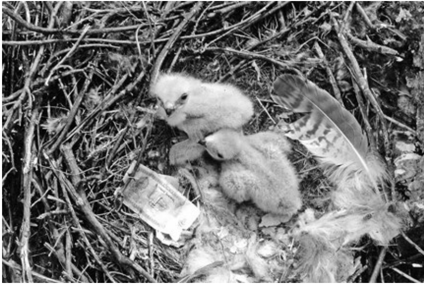
Figure 10. Paper money (two bills) line the cup of this Upland Buzzard nest, eastern Mongolia, 14 June 1995.

vegetation, we concluded that it arrived as nesting material, not as an attachment to mammalian prey.