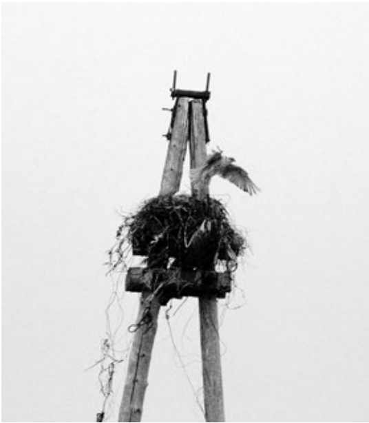
Figure 11. Wire nest on an abandoned power pole occupied by Saker Falcons, southeastern Mongolia, 5 June 1997.

Two other Golden Eagle nests were near human activity. One was within 90 m of a paved and busy highway along the White River in western Colorado and within 210 m of, and in view of, an occupied farm house. The condition of the excrement and