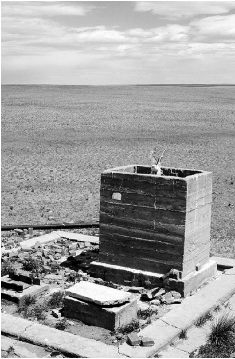
Figure 2. Adult Saker Falcon leaving the cistern eyrie, southeastern Mongolia, 8 June 1998. The hole was punched through the wall in June 1997 so the nestlings could fledge.

on foot without climbing) on easily accessible hillsides or even on the open steppe. In wolf ( Canis lupus ) and fox ( Vulpes spp.) habitat, such nests would seem likely to fail, but fledged young are regularly seen in and around these structures. Strangely, ground nests are occasionally seen immediately adjacent to conspicuous artificial objects. One surrounded a ca. 70-mm-diameter iron rod emerging from the steppe (Fig. 3). Another nest