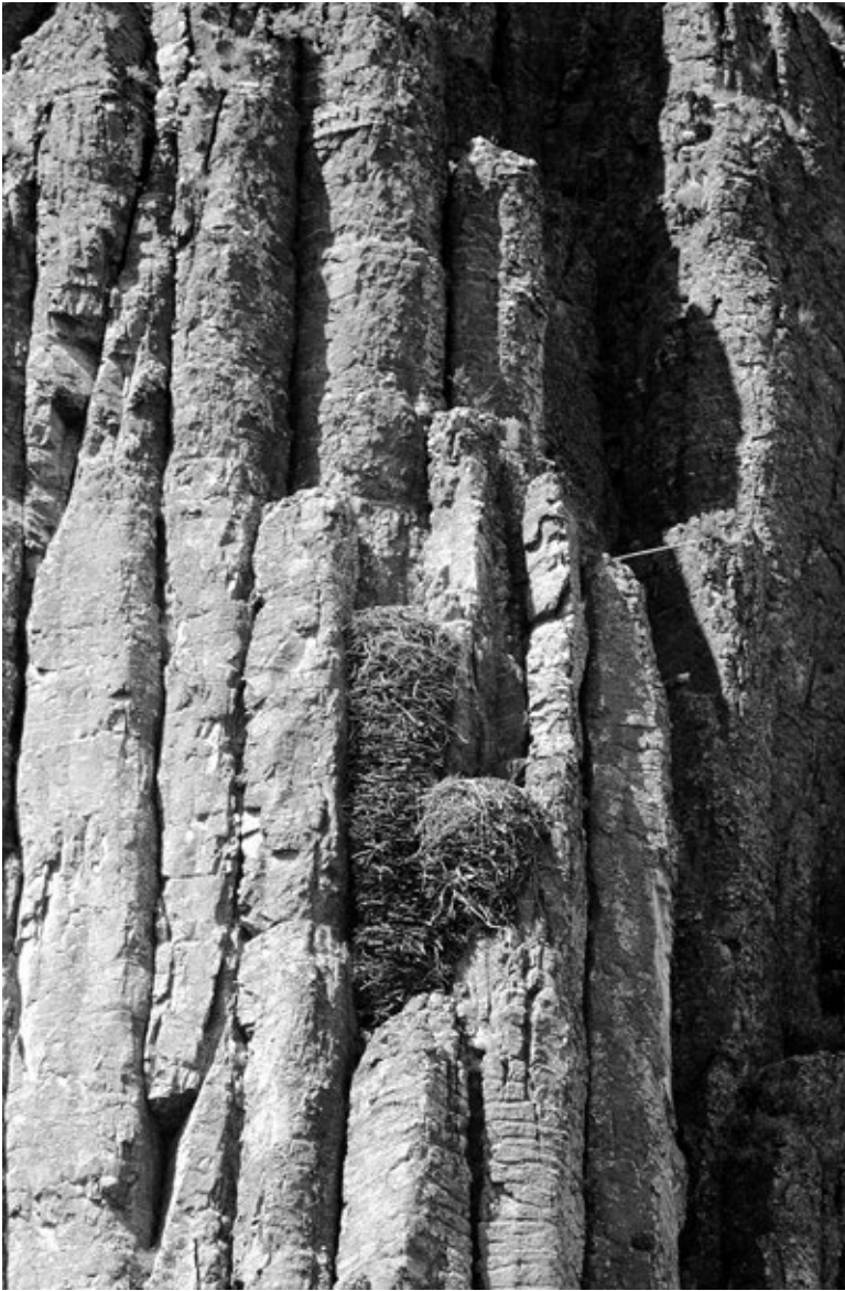
Figure 15. Sun River Golden Eagle nest in central Montana, 30 August 2002. In 2004, an extreme height measurement of the left, larger nest was 7.0 m.

to have been used in recent years, many molted Golden Eagle feathers were found at the cliff rim, and a lone adult was present on one of three visits.