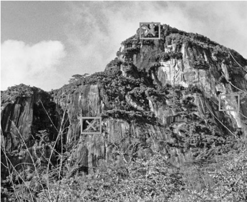
Figure 14. Morne Blanc on the Island of Mahé, Seychelles, showing the location of three nesting sites of Seychelles Kestrels.

their two eggs less than 4 m above (Jacobs 1908), (4) Red-tailed Hawks ( Buteo jamaicensis ) nest-building on the canopy of an occupied Black-billed Magpie ( Pica hudsonia ) nest (Ellis 1992), and (5) a Saker Falcon brood only 4.4 m above a brood of Upland Buzzards (Ellis et al. 1997). In each case, the paired species were known antagonists. The complexities of symbiotic nesting were detailed by Haemig (2001).