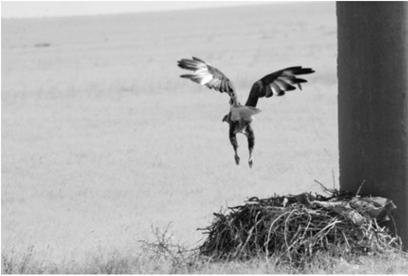
Figure 5. Many Upland Buzzard nests, especially in eastern Mongolia, are placed on the ground next to power or telephone poles. Where poles have sufficient arms and wires to support a nest, ground nests are seldom encountered (May 2008).

100 m of an active fossil fuel pumping station southwest of Powder River, Wyoming.