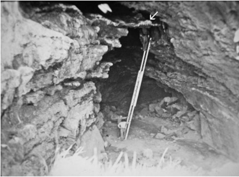
Figure 18. Prairie Falcon eyrie (arrow) recessed ca. 10 m from the opening of a lava tube on the Snake River Plain of Idaho. Pale streak is an adult falcon.

where foxes (two species) and wolves are widespread, most Golden Eagle nests are on cliffs, but we have found six nests on boulder-strewn hillsides, and two on flat ground at the very edge of a cliff, where a mammalian predator could easily walk to the nest.