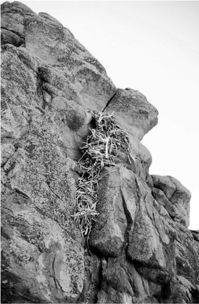
Figure 24. Common Raven nest (1998, central Mongolia) composed primarily of rib bones of large mammals. This nest was used in 2008 by Saker Falcons.

Geological Survey Southwest Biological Research Center, and Bureau of Land Management, Central Yukon Field Office.