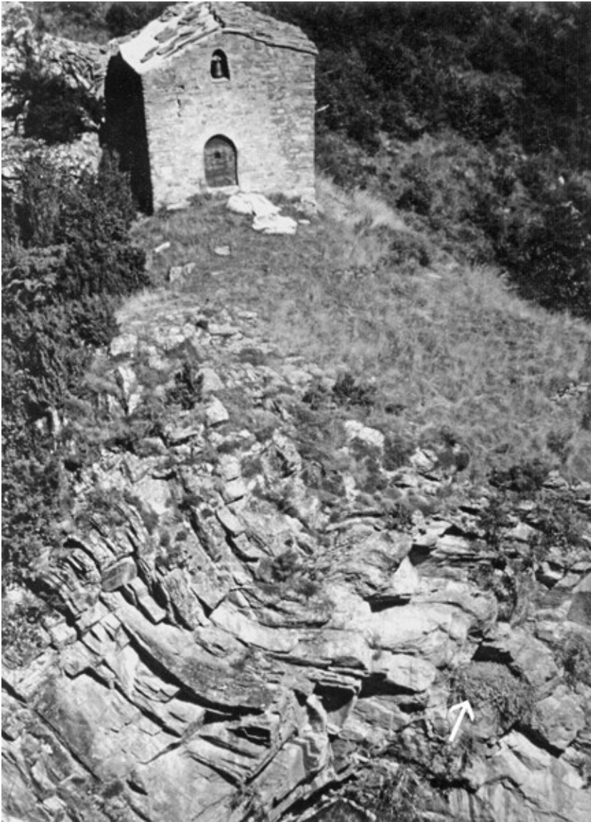
Figure 13. Remote chapel in Catalonia, Spain, with nearby Golden Eagle nest (arrow). Photograph: September 2003, Antoni Margalida.

falcons nested horizontally only ca. 10–20 m from the ravens. However, these nests were 120 m apart vertically; the falcon eyrie was ca. 40 m from the top of the 210-m cliff and the raven nest was ca. 120 m below the falcons. When nesting in areas frequented by Golden Eagles, peregrines and ravens often nest commensally in the “distant vicinity” of each other (Sergio et al. 2004). Either species can warn of an eagle attack, and both mob eagle intruders.