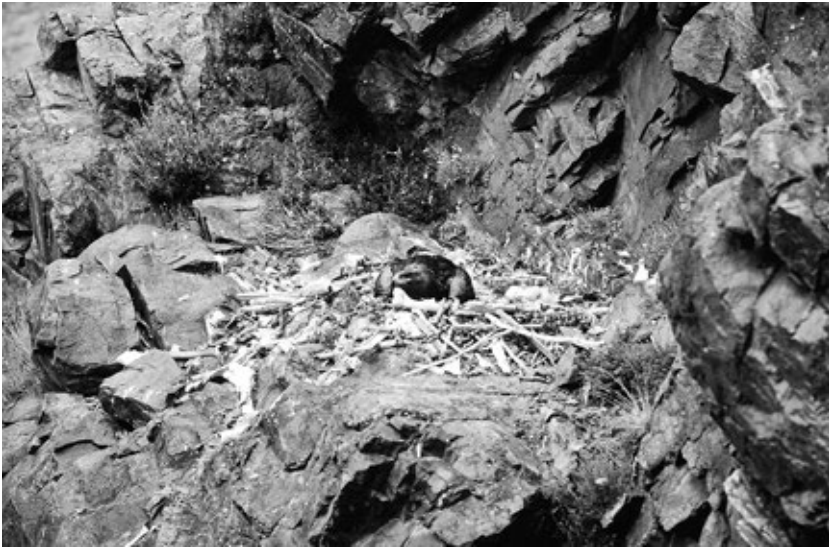
Figure 23. Steppe Eagle nest in northwestern Mongolia composed primarily of bones of large mammals, 25 June 1994.

mented by Grubb and Eakle (1987) for 12 Golden Eagle nests in Arizona.