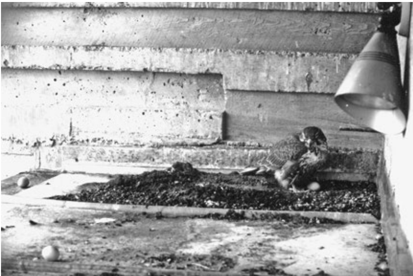
Figure 8. First documented nesting of Prairie Falcons on a building. Yearling Prairie Falcon at her scrape at the University of Calgary, 1 May 1974. Her third egg is in the scrape. The first and second are scattered about the metal ledge.

courting. The first egg was laid on 26 April in a thin layer of dried pigeon (Rock Pigeon [ Columba livia ]) manure on sheet metal in a back corner of a large, north-facing cavity (ca. 4 m × 1.3 m × 1.6 m high) just above the upper floor (Fig. 8). Rain turned to