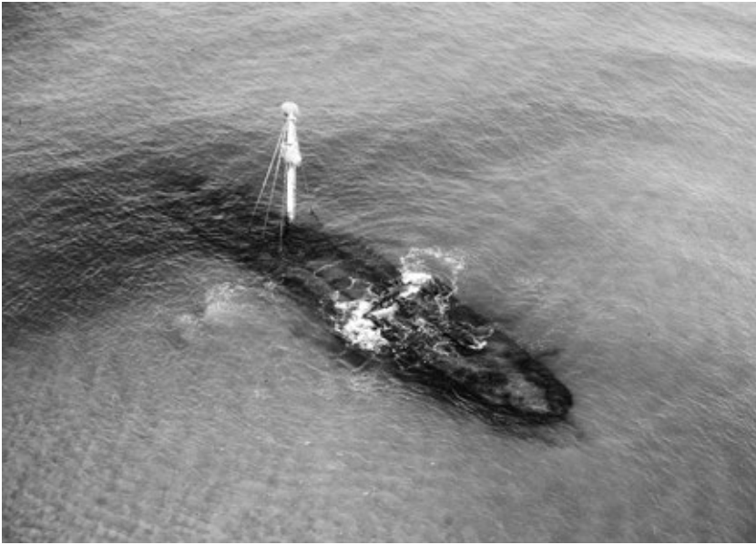
Figure 1. Osprey nest on the mast of a sunken boat, southern Baja California, 27 March 1977.

2000) are worth publishing. Our emphasis is on providing photographic documentation of some of the most unlikely records.