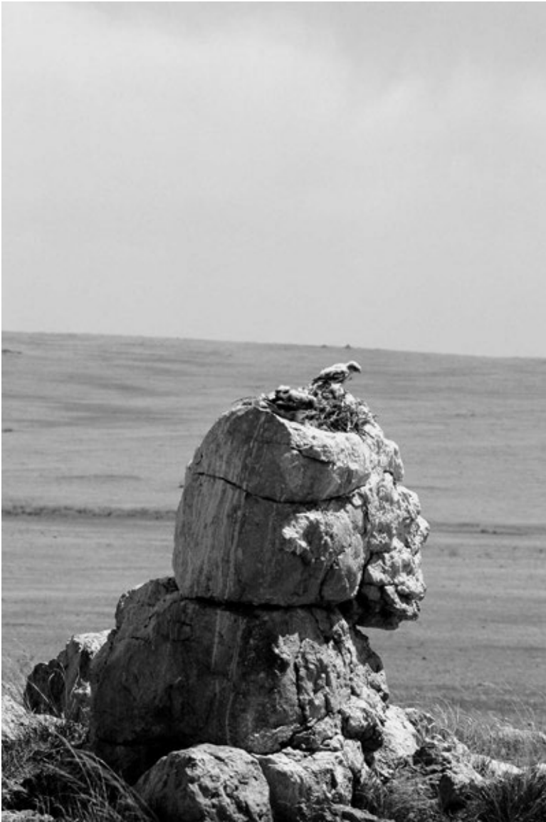
Figure 17. Saker Falcon eyrie atop a 1.7-m boulder in southeastern Mongolia, 12 June 1997.

ground nests are extremely rare. Exceptional records include Barred Owls in both Michigan and Florida (Postupalsky 2001) and Bald Eagles in Michigan (Brigham 1939). For both of these species, elevated nesting sites were readily available. Another (albeit unsuccessful) ground nesting of Bald Eagles took place in an open stubble field ca. 60 m from a regularly used dirt road in Ohio in 1976. Ground nesting on the open steppe is common in the Steppe Eagle, and Golden Eagles infrequently nest