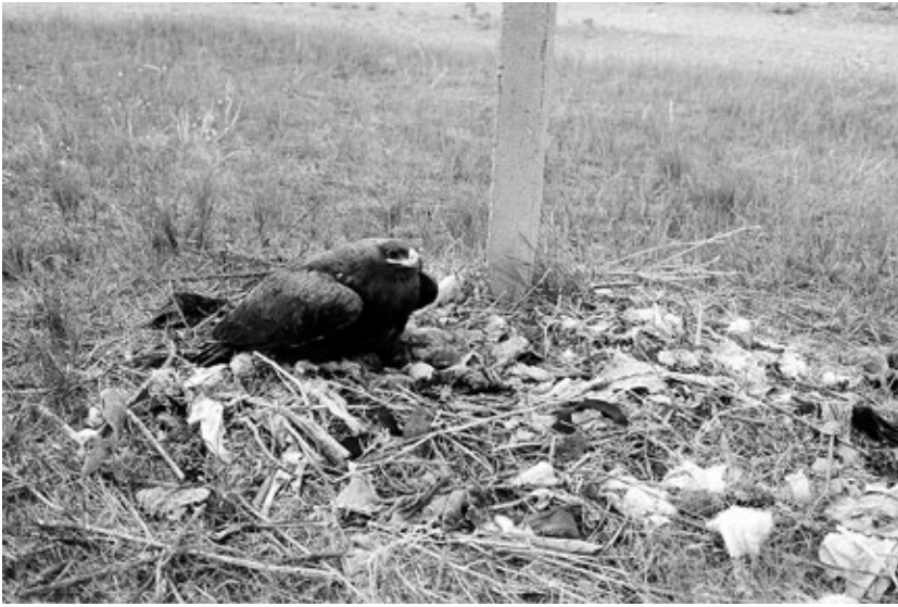
Figure 12. Adult Steppe Eagle attending eaglet and egg at the foot of a concrete post between the most actively used lanes of a dirt road in eastern Mongolia, 12 June 1995.

nest materials during a July 2006 visit indicated the nest was in use as late as 2005. The second pair (central Mongolia) nested in 2008 only 15 m from a footpath to a regularly visited, mountaintop shrine. Although this nest (with one nestling) was over a ridge top from the path, three alternate nests were on the same side of the ridge as the path and within ca. 35 m of it. All four nests were decorated with silk scarves and other cloth associated with people visiting the shrine.