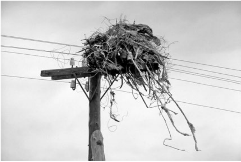
Figure 9. An extreme example of an Upland Buzzard trash nest in southeastern Mongolia, 4–5 June 1995.

wet snow overnight with temperatures just below freezing. The following morning, the single egg lay on bare metal. After waiting until the female left the ledge, we spread sand on the ledge and placed the egg in a shallow depression. Following the blizzard, the male ceased his courtship and food deliveries. People then provided the female with ground squirrel ( Citellus sp.) carcasses, which she ate. She laid three more eggs, but they were soon scattered about the ledge and disappeared one by one. Only one egg remained when the female finally abandoned the ledge. On sunny days in mid-May, the pair resumed courtship, including copulations, but no replacement clutch was laid, and no breeding attempt was made there in subsequent years.