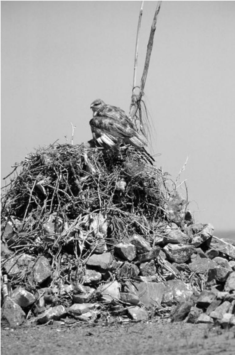
Figure 22. Upland Buzzard nest on a mountaintop shrine, southeastern Mongolia, 11 June 1997. Note that this nest, far from human activity, is built almost entirely of natural vegetation.

At two Golden Eagle nests in central and one in southeastern Mongolia, we noted that some sticks were larger than normally seen in eyries, so we measured the four largest. At one eyrie, the largest stick accessible (i.e., not buried in the matrix) was 2.31 m long (chord) and 2.76 m (along the curvature). Its circumference at base (hereafter "circ. b.") was 11.6 cm (3.7 cm diameter). At another eyrie, the largest accessible stick was shorter (97.8 cm [chord];