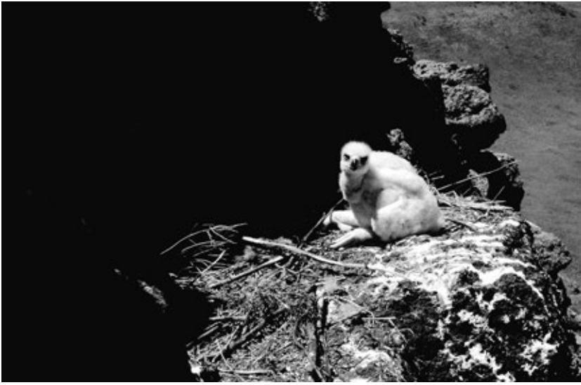
Figure 16. A rudimentary Golden Eagle nest in southeastern Mongolia photographed 11 June 1998. Eaglet rests on rock substrate.

the Colorado River. When inspected from the cliff rim, on 2 May 2000, a single young eaglet (age ca. 30 d) lay on a flat sandy shelf; no sticks other than the basal limbs of the shrub were visible. A sizeable stick nest was available at a distance of ca. 200 m.