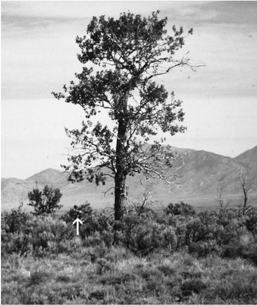
Figure 20. Swainson's Hawk nestlings (arrow) ca. 1 m aboveground in a sagebrush near Howe, Idaho.

usual raven nests, both from Mongolia, built almost entirely of rib bones. The outer rim of a nest (ca. 75 cm wide, 42 cm deep) found 24 June 1994 at the mouth of the Hobolnoor River in extreme northwestern Mongolia was almost exclusively constructed of rib bones (probably of domestic animals). Evidence at the site indicated that ravens had recently fledged. The second rib nest was found in central Mongolia on 1 July 1998 (Fig. 24). It was then ca. 60 m from an active Saker Falcon eyrie (also in a probable raven nest). In 2008, sakers fledged at least three young from the rib nest. By 2008, about a fourth of the bones had fallen: below the nest, we counted 220 ribs or large rib fragments (>10 cm in length) and noted thousands of smaller