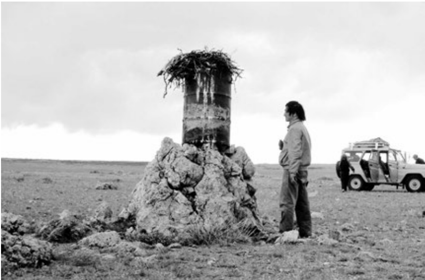
Figure 6. Upland Buzzard nest atop a metal barrel, southeastern Mongolia, 7 June 1998. D. Batdelger is pictured.

Although Prairie Falcons ( F. mexicanus ) nest almost exclusively on cliffs (Steenhof 1998), we have one record of nesting on a building. Following two