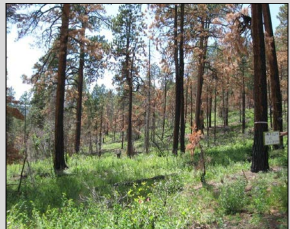
Burn Only Treatment: one year after treatment

The Ecological Restoration Institute is dedicated to the restoration of fire-adapted forests and woodlands. ERI provides services that support the social and economic vitality of communities that depend on forests and the natural resources and ecosystem services they provide. Our efforts focus on science-based research of ecological and socio-economic issues related to restoration as well as support for on-the-ground treatments, outreach and education.