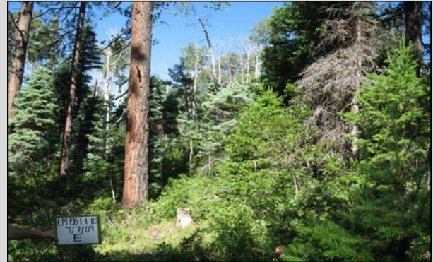
Untreated Control: fire excluded for more than a century

In an effort to restore forest structure and function, land managers have focused on tree thinning and prescribed fire to create stands that are more productive and potentially more resilient to drought and stand-replacing crown fire. In this study, we set out to test alternative approaches that included evidence-based thinning, based on site-specific historical stand structure, and prescribed fire versus prescribed fire-only treatments. In 2003, we established a randomized, replicated experiment in a warm, dry mixed-conifer forest on the San Juan National Forest in southwest Colorado. The objectives of our study were to 1) compare the effects of treatments (Thin and Burn, Burn only, and untreated Control) on forest composition and structure; and 2) compare post-treatment stand structure with site-specific reconstructed reference conditions, as reported in Fulé et al. (2009).