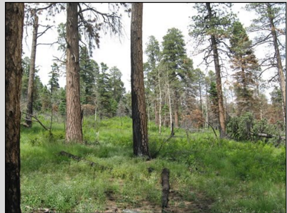
Thin and Burn Treatment: one year after treatment