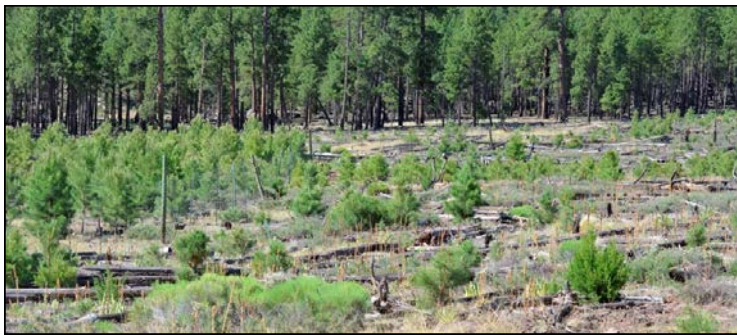
Figure 1. Ponderosa pine seedlings planted in a high-severity burn patch in northern Arizona.

Climate change models predict increases in temperature and more frequent severe droughts and forest fires in the Southwest United States (Garfin et al. 2013). Aridity stress to forests caused by climate change will be especially severe in forests and woodlands of the Southwest because productivity is already strongly limited by low precipitation and humidity (Williams et al. 2013). Intense drought predisposes trees to disease and insect attack, such as bark beetles that have killed many trees in the Southwest in the last two decades (Raffa et al. 2008, Gaylord et al. 2013). Climate warming and fuel buildups in the Southwest are increasing wildfire-caused deforestation (Williams et al. 2010, Williams et al. 2013). There is a high risk of conversion of ponderosa pine forests to grassland or shrubs when intense burning, drought, or bark beetles cause high tree mortality, create large openings, and kill local tree seed sources (Roccaforte et al., 2012). Future increase in drought intensity caused by climate warming will reduce opportunities for ponderosa pine regeneration after deforestation (Savage et al. 2013). Moreover, climate-envelope models predict substantial shrinking of the range of ponderosa pine in the Southwest over the next century, especially at low-elevations (Rehfeldt et al. 2014).