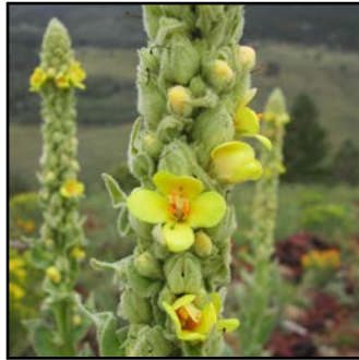
Verbascum thapsus (common mullein).