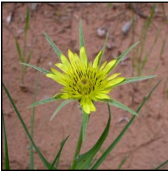
Tragopogon dubius (yellow salsify).