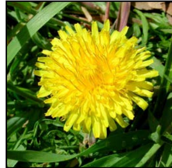
Taraxacum officinale (common dandelion).