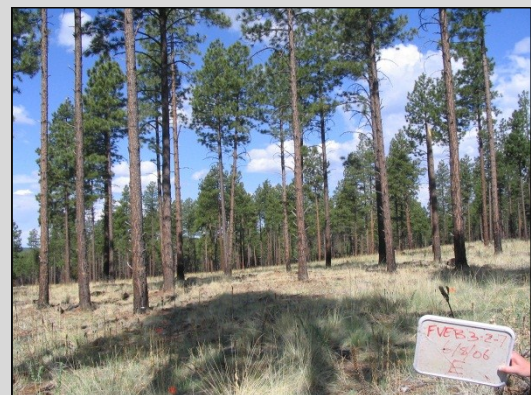
Six years after treatment (2006), the understory is dominated by native grasses.

The Ecological Restoration Institute is dedicated to the restoration of fire-adapted forests and woodlands. ERI provides services that support the social and economic vitality of communities that depend on forests and the natural resources and ecosystem services they provide. Our efforts focus on science-based research of ecological and socio-economic issues related to restoration as well as support for on-the-ground treatments, outreach and education.