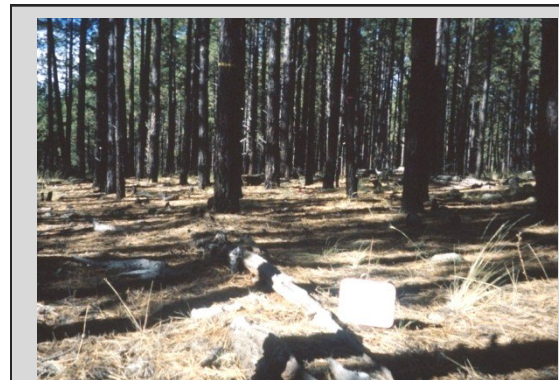
Forest floor is thick with debris and lacking in understory plants in this pre-treatment photo from 1998.