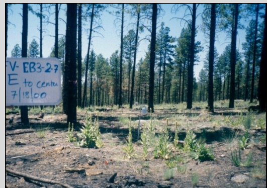
In one year post-treatment (2000), the foreground is dominated by non-native forbs.