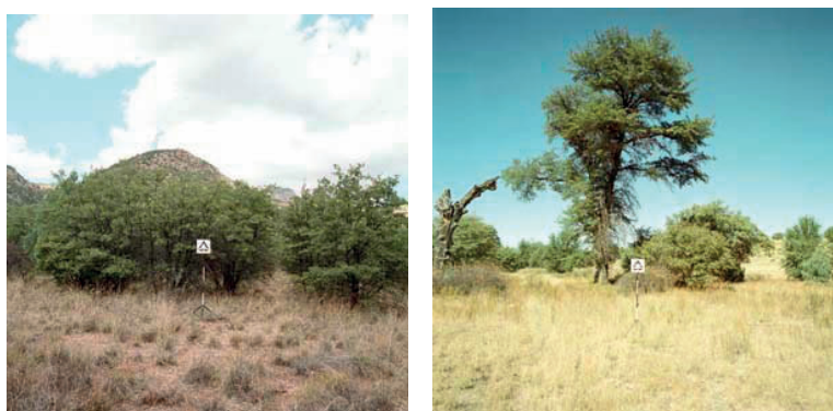
Examples of photos taken from the Digital Photo Series

The main advantage of using photo series is that it is relatively easy to learn and doesn't require a great deal of investment in time or resources. A disadvantage of using photo series is that live surface fuels may not always be visible in the photographs. For this reason, using the photo load method may be more appropriate for live surface fuels. In addition, photo series are not available for all vegetation types and photo load series are not available for all plant species. Thus, this method is not available in all instances. Although, with the development of the fuel characteristic classification system and the digital photo series, the range of vegetation types with associated photo series has greatly expanded. It is important to note that even if a photo series is available for vegetation type of interest, it may not reflect the appropriate season or successional stage. Thus, it should always be used with caution.