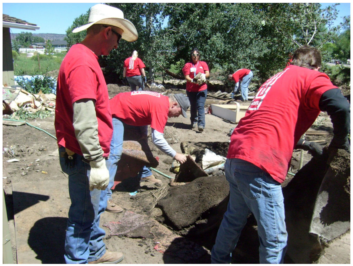
Figure 2: Volunteers clean up flooded property