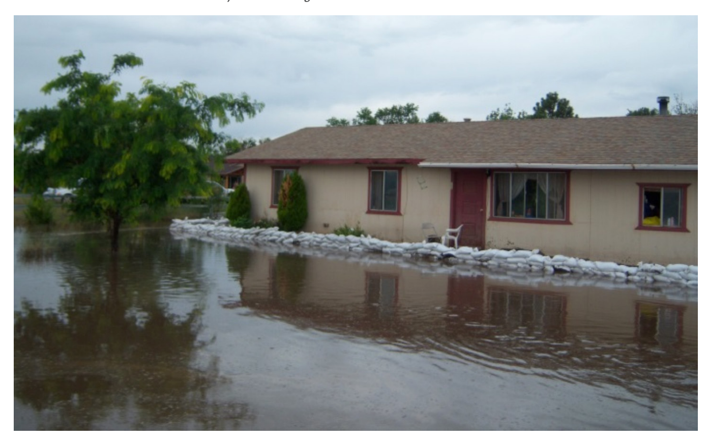
Residents used sandbags to create a berm against the heavy floodwaters that inundated their property after the fire.