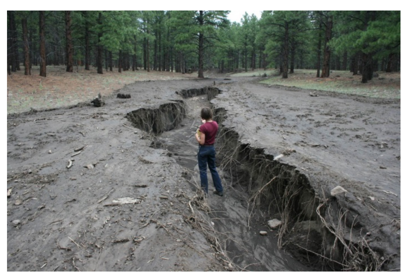
The force of the flood waters, which contained large amounts of debris and ash, carved deep channels below the Schultz Fire burn area.