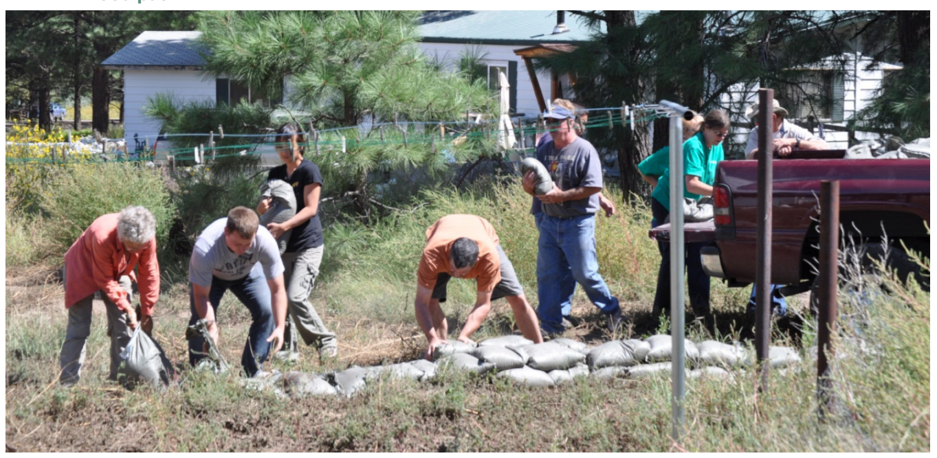
Figure 3: Volunteers coordinated by the United Way of Northern Arizona lay sand bags in an anticipated flood path

The United Way also used assistance funding to provide home repairs to 25 families. These repairs included flooring, drywall, painting, earthwork, labor, building supplies, emergency shelter, and miscellaneous supplies. Additionally, the organization coordinated specially-skilled volunteers who offered professional services to those in need.