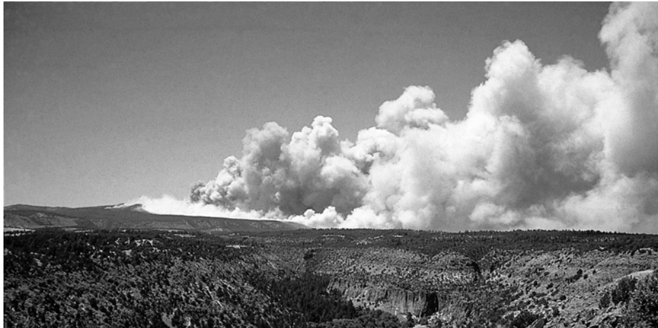
FIG. 2. View looking northwest at the Cerro Grande Fire on the afternoon of 10 May 2000 as it burned toward Los Alamos, New Mexico (USA). Similar large, stand-replacing fires are becoming increasingly common in Southwestern ponderosa pine forests.

scape scales (Cooper 1960, White 1985), with pattern shifts through time within a natural range of variability (Swetnam et al. 1999).