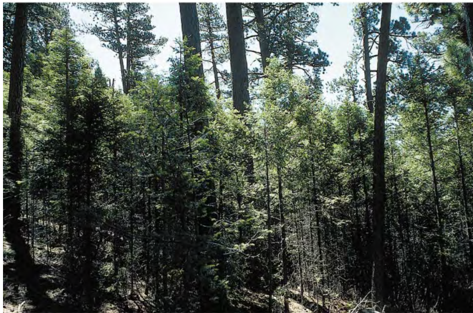
FIG. 1. Ponderosa pine forests of the American Southwest. (Top) Open ponderosa pine forest representing “typical” pre-1900 conditions, with grassy understory and surface fire activity. (Bottom) Altered ponderosa pine stand in need of restoration, showing changes in both stand structure and species composition. The dense midstory of mixed conifer trees provides ladder fuels that favor crown fire development.

port the development and implementation of a diverse range of scientifically viable restoration approaches in these forests that address the critical issues of forest heterogeneity, scientific uncertainty, and effects on wildlife. In addition, we suggest principles for ecologically sound restoration approaches. It is not our intention to emphasize a critique of any particular model, but we do present ecological perspectives on several alternative forest restoration approaches.