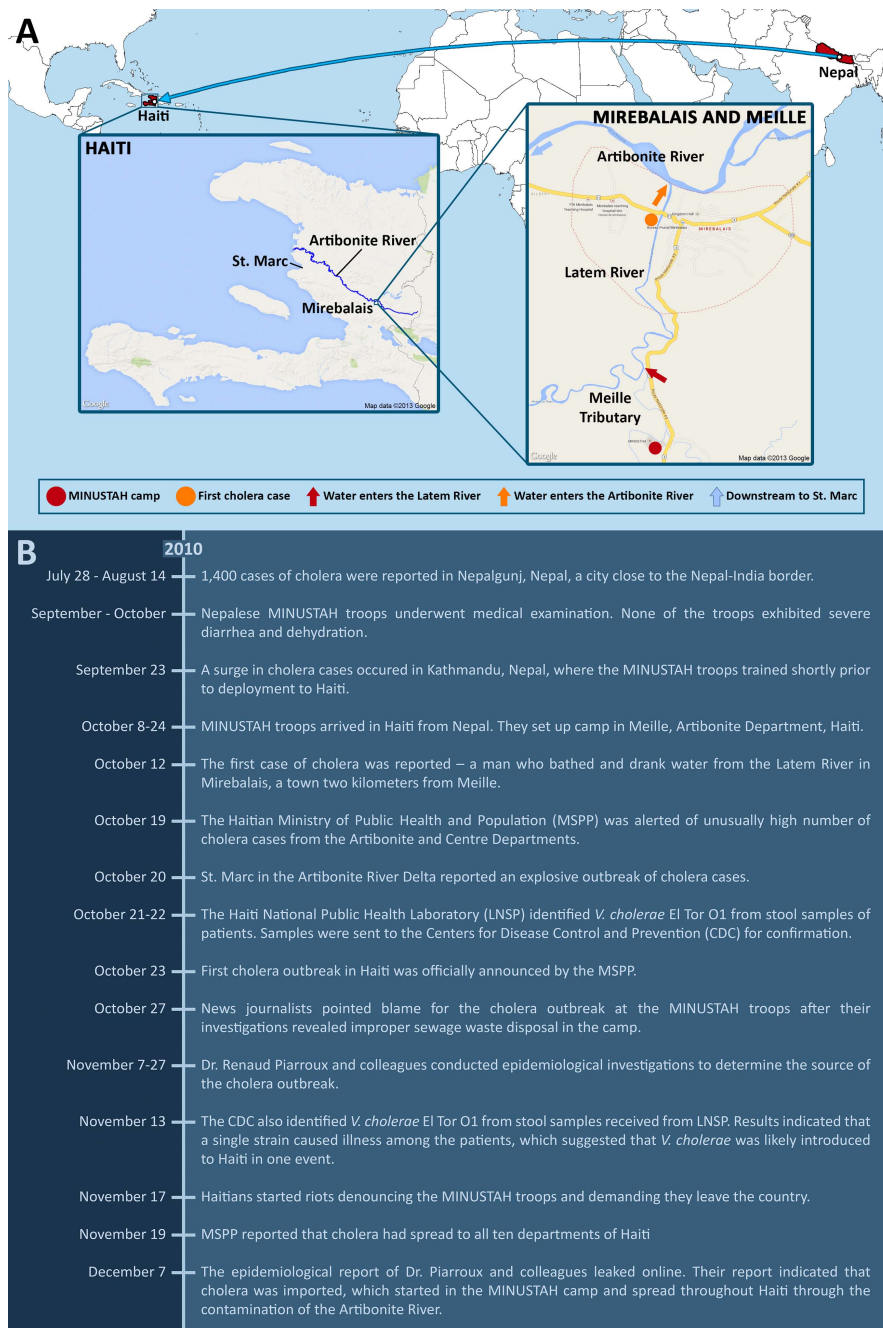
Figure 2. How the Haiti cholera outbreak started. (A) MINUSTAH troops from Nepal were stationed in Haiti starting on October 8, 2010, and set up camp in Meille (red circle). Improper disposal of sewage led to the contamination of the Meille tributary, which connects downstream to the Latem River (red arrow). The first case of cholera occurred on October 12 along the Latem River in Mirebalais (orange circle), 2 km north of Meille. Water from the Latem River enters the Artibonite River (orange arrow), the major river that spans across Haiti, which flows downstream to St. Marc (blue arrow). The Artibonite River played a significant role in the rapid spread of cholera. During the early onset of the epidemic, reported cases were linked to proximity with the river. (B) A chronological timeline of events involving the Haiti cholera outbreak from July to December 2010. doi:10.1371/journal.ppat.1003967.g002

that included South Asia, Thailand, and Africa, but not the Americas. The study by Chin and colleagues suggested that cholera was introduced into Haiti through human transmission from a distant geographic source, most probably from South Asia (i.e., Bangladesh), although their conclusions were based upon a very limited strain analysis from both Haitian and global populations.