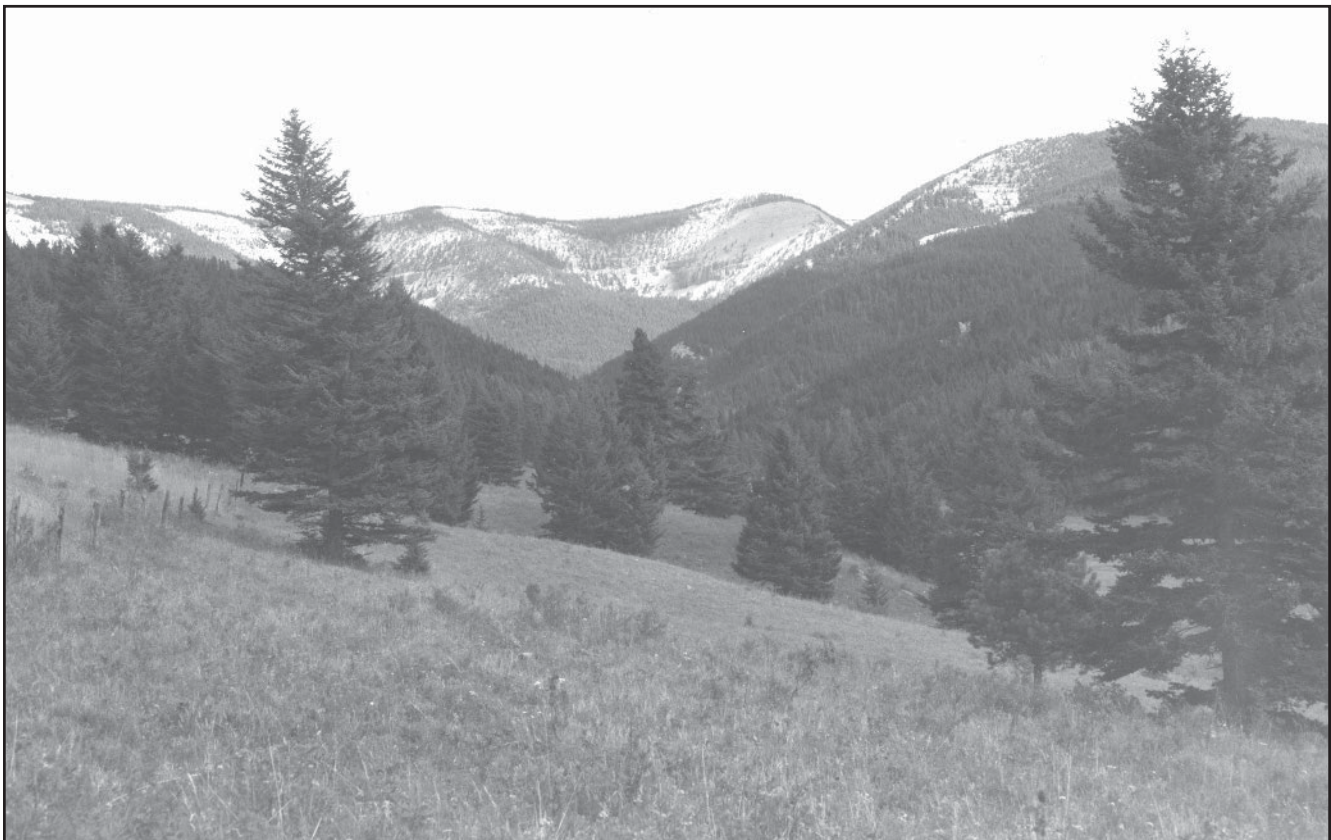
Figure 1(F) —August 20, 1980—71 years later. Camera was moved left of original point to avoid trees that screened early view. Regeneration of Douglas-fir has resulted in a landscape dominated by conifers. The rock outcrop visible in 1909 is now almost totally obscured by tree growth. Conifer competition has largely eliminated early successional understory species.