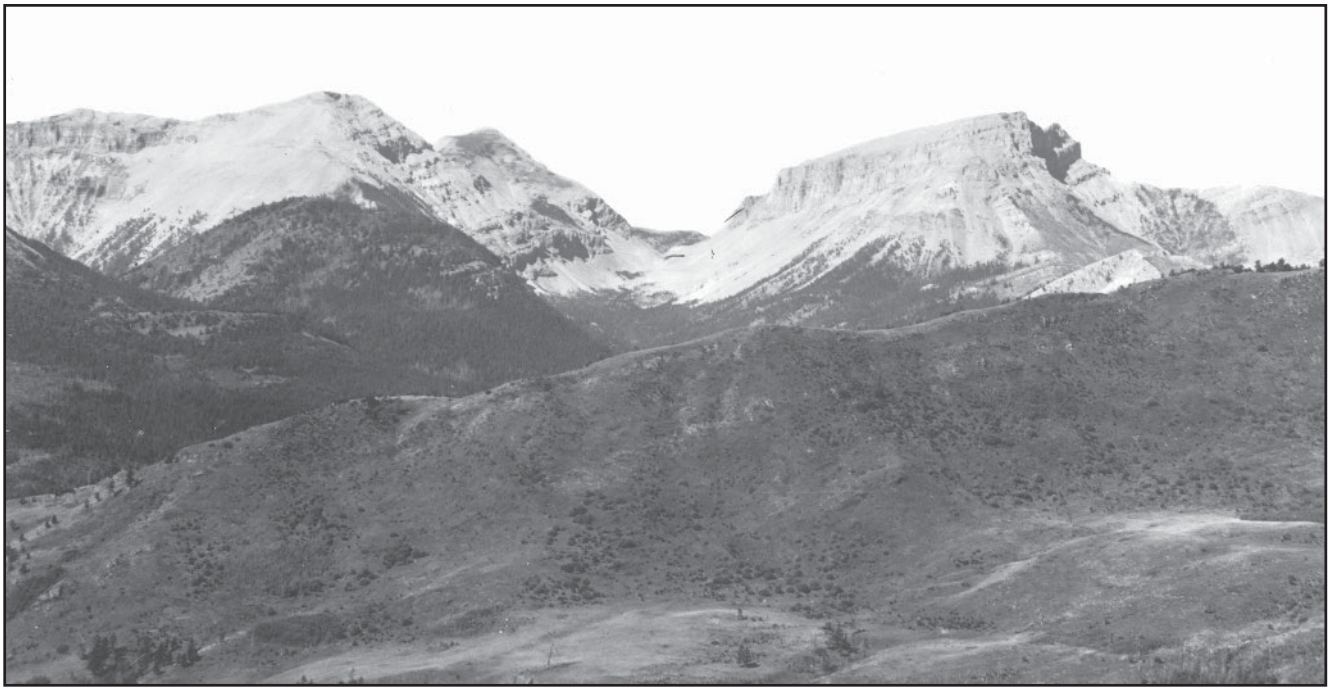
Figure 1(G) —1900. Fire Group 6: moist Douglas-fir. Elevation 5,300 ft (1,616 m). From the ridge about 5 miles west of Haystack Butte, the view is southwest across Smith Creek toward Crown Mountain on east front of Rocky Mountains, Lewis and Clark National Forest. Near slopes are in early succession following wildfire in latter 1900s that removed conifers and stimulated production of aspen, willow, chokecherry, mountain maple, and other deciduous vegetation. Stumps resulting from timber cutting and snags indicate that the pre-1900 conifer stands were less dense than current stands.