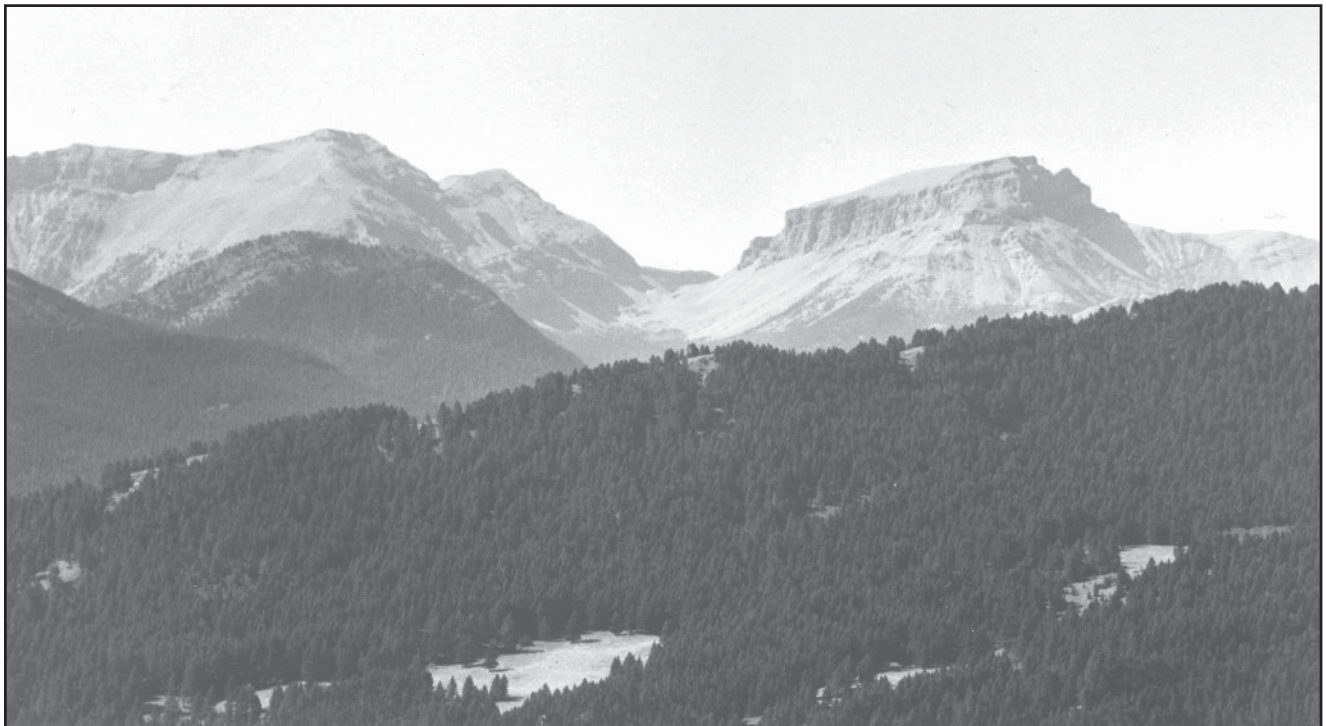
Figure 1(H) —September 16, 1981—81 years later. Slopes below camera point and adjacent terrain as well as near slope are now densely covered by Douglas-fir. View was obtained by cutting screening fir and climbing one of the larger Douglas-fir about 50 yards from original camera position at top of ridge. Canopy closure has resulted in a decline in condition of deciduous species.