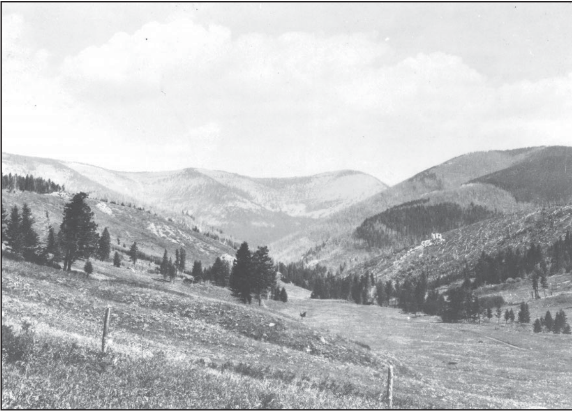
Figure 1(E) —1909. Fire Group 6: moist Douglas-fir. Elevation 6,100 ft (1,860 m). Looking north-northwest up Blake Creek at a point 1 mile above forest boundary on south side of Big Snowy Mountains, Lewis and Clark National Forest. Scene shows effects of wildfire in the late 1800s that burned both sides of drainage. Scattered ponderosa pine and Douglas-fir occupy near slope and canyon bottom. Herbs and shrubs comprise early successional vegetation in burned areas. On right, fire created a mosaic of burned and unburned timber. Note rock outcrop in burned stand (U.S. Geological Survey photograph 114 by W. R. Calvert).