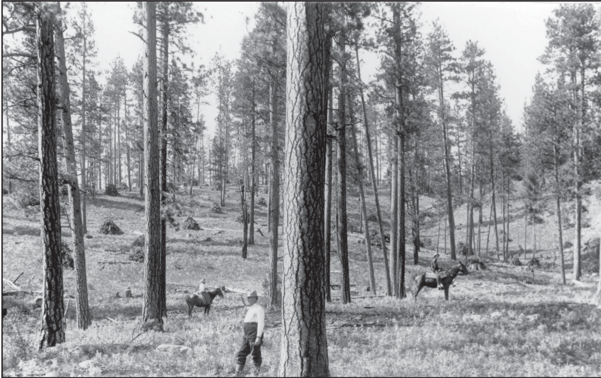
Figure 1(A) —1909. Fire Group 4: warm-dry Douglas-fir. Elevation 4,400 ft (1,341 m). A northwesterly view showing cleanup operations on the Lick Creek timber sale, Bitterroot National Forest, near Como Lake. The number of stumps and slash piles suggests that this was an open ponderosa pine stand, a condition typical of the bitterroot Valley where stands had been subjected to frequent ground fires. Fire scar samples showed a mean fire interval of 7 years between 1600 and 1900. The understory appears to have a high incidence of lupine, but few shrubs are evident. Forest Service “lumberman” C. H. Gregory stands in foreground.