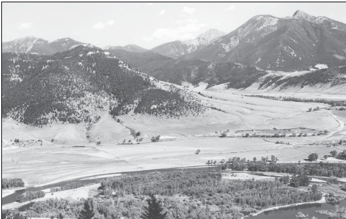
Figure 1(D) —July 27, 1981—110 years later. A dense stand of Douglas-fir, limber pine, and Rocky Mountain juniper now occupies near slope shown in original view. The grass cover on this slope has been largely eliminated by tree canopy closure. Camera was moved approximately 100 yards down slope to allow unobstructed view of distant slopes. Tree cover on distant slopes has increased dramatically.