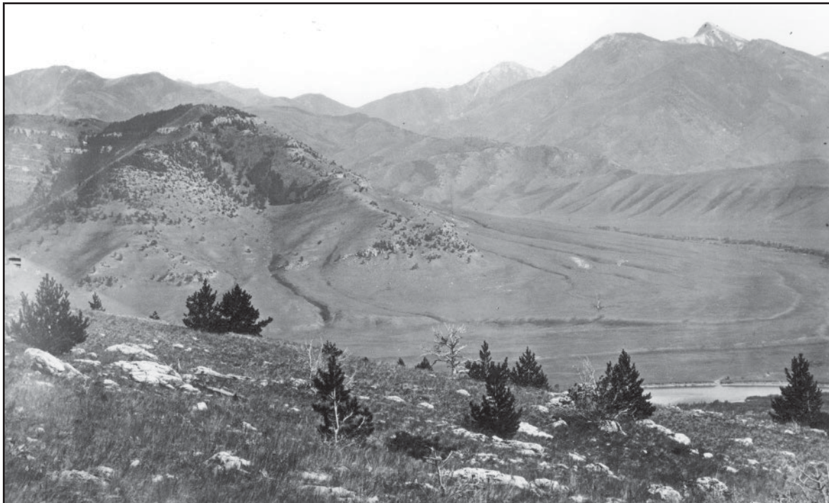
Figure 1C —1871. Fire Group 5: cool-dry Douglas-fir. Elevation 6,200 ft (1,890 m). High on the slopes above the Yellowstone River 10 miles southeast of Livingston, the view is east toward the head of Suce Creek. Snags and age of young limber pine on near slope indicate locality was swept by wildfire several decades earlier. Based on present plant composition, ground cover was apparently dominated by Idaho fescue and bluebunch wheatgrass. Fire mosaics are evident in the distance (W. H. Jackson photograph 57-HS-1213, courtesy of National Archives).