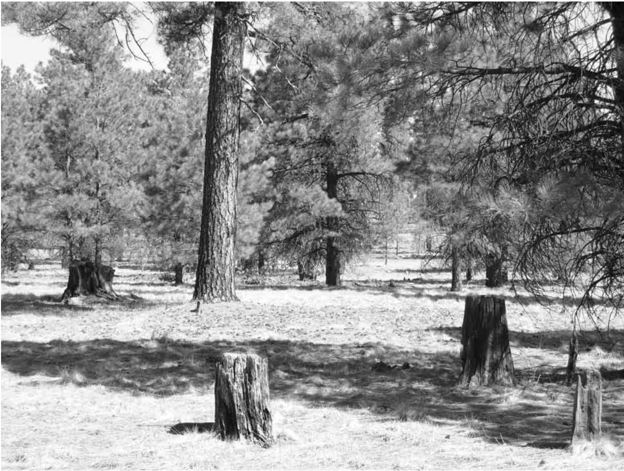
Figure 1. Examples of stumps (foreground, and to the left of the large tree), indicative of historical tree locations, and a live tree of pre-settlement origin (left-center). in 2009, Forest Road 3E, Coconino National Forest, northern Arizona (UTM: 440,918 m E, 3,885,850 m N, North American Datum 1983).

pine forests. The goal of thinning is not necessarily to replicate historical conditions (prior to late 1800s Euro-American settlement), but rather to reduce tree densities to levels that support surface fires instead of crown fires (Covington 2003). As a result, knowledge of the historical forest structure can help with the planning of thinning projects by providing estimates of tree densities that were sustainable through at least several generations of trees (Allen and others 2002).