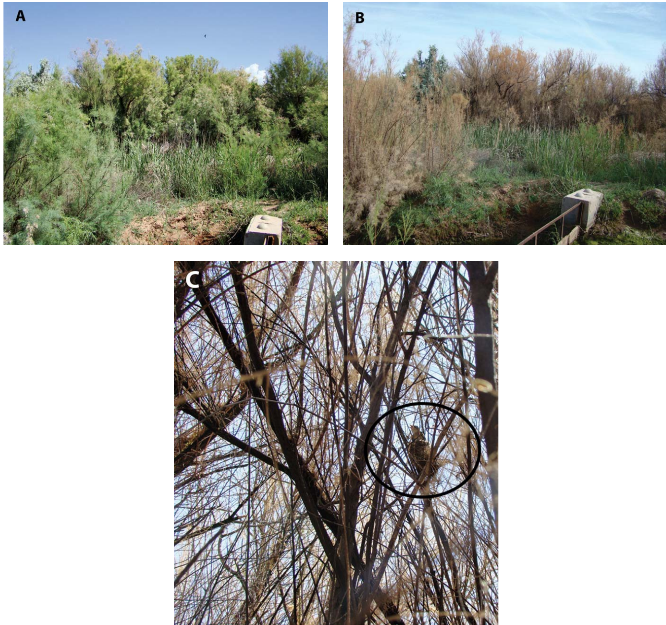
FIGURE 1. (A) Habitat in which the Southwestern Willow Flycatcher breeds at St. George, Utah, prior to tamarisk defoliation. (B) The same habitat during defoliation. (C) Active flycatcher nest (circle) that eventually failed in tamarisk-dominated habitat at St. George, 2008, during defoliation.

defoliating insects follow a similar pattern. As a first step in investigating the potential effects of tamarisk beetle biocontrol on birds, we searched the literature in Science Citation Index Expanded, accessed via the Web of Science ( http://thomson-reuters.com/products_services/science/science_products/a-z/web_of_science ), using the terms “defoliation,” “insect outbreak,” and “insect irruption” combined with the terms “bird,” “birds,” and “avian.” This search returned 21 articles published